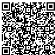
Online Checkout Link (Team)